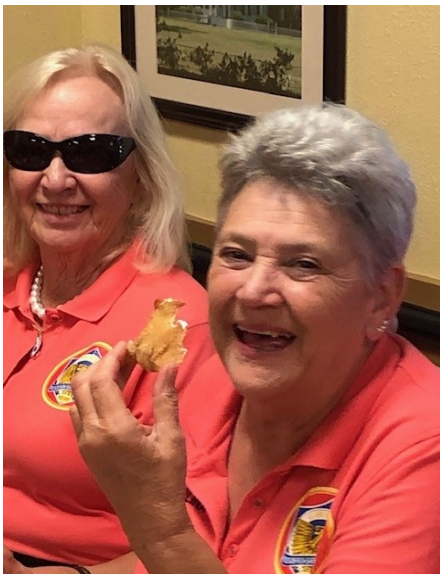
I think these ladies are up to no good