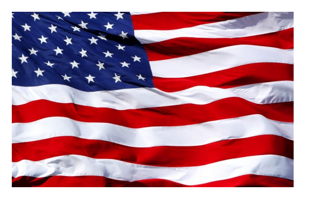
God Bless America

He's feeling pretty good until he looks in his mirror and sees the old man gaining on him again. Astounded by the speed of this old guy, he floors the gas pedal and takes the Ferrari all the way up to 250 mph. Not 10 seconds later, he sees the Moped bearing down on him again. The Ferrari is flat out, and there's nothing he can do! Suddenly, the Moped plows into the back of his Ferrari, demolishing the rear end. The doctor stops and jumps out, and unbelievably, the old man is still alive. He runs up to the mangled old man and says, "Oh my gosh! Is there anything I can do for you?" The old man whispers, "You could unhook my suspenders from your side view mirror.