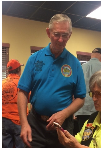
Someone needs to keep an eye on her