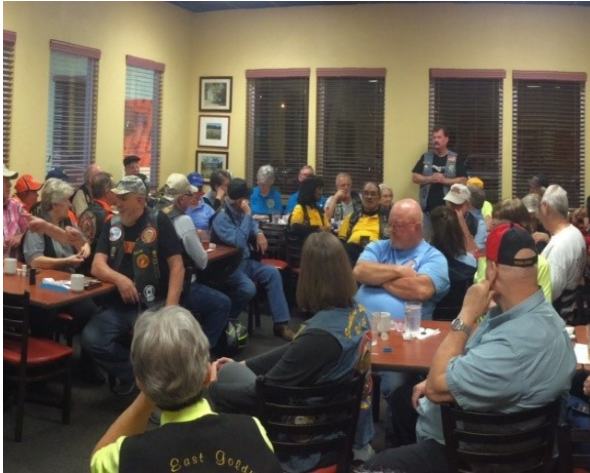
Good looking group of people If I have to say so myself