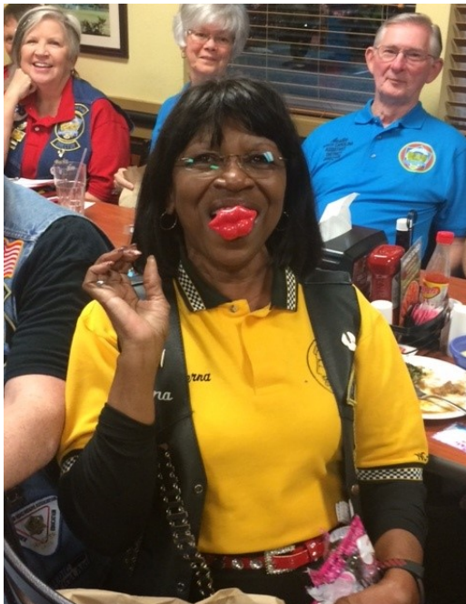
Only she could pull these lips off