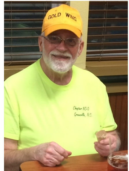
I am really happy