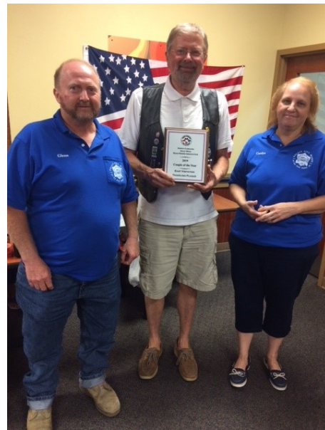
Passing of the Couples Plaque