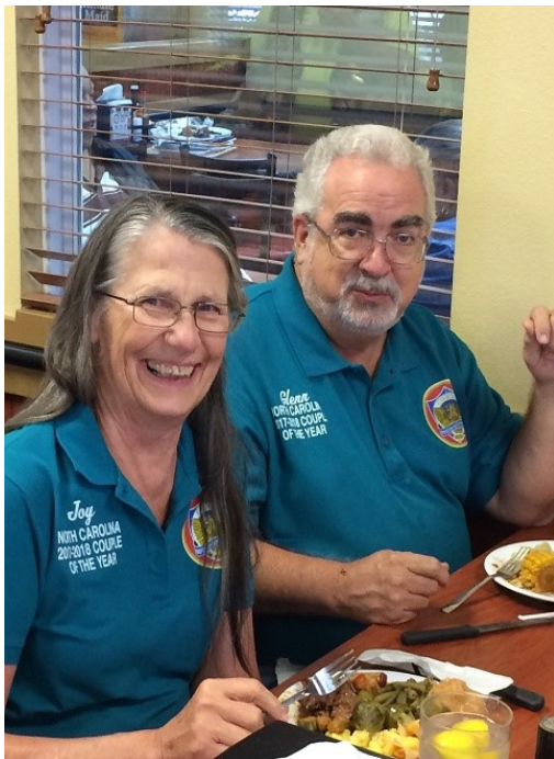
The District Directors for 2020 We all wish them the Best